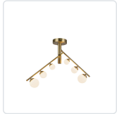
SF55525-BG/OP Brushed Gold/Opal Matte Glass