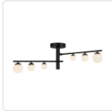
SF55525-BK/OP Black/Opal Matte Glass